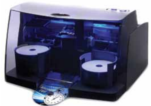
The new Primera DP-4100 series

Perennity extracts all relevant metadata (patient and study information) from the processed DICOM images and stores these in a database (MySQL or MS SQL Server). Up to five custom fields (DICOM tags) can be defined for extraction and printing.